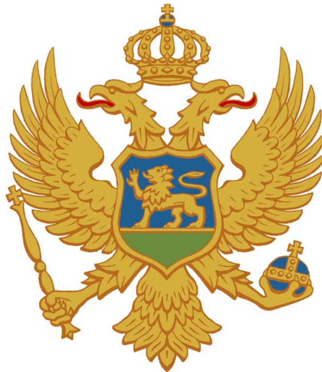
Montenegro's våben [klik på billedet for at forstørre det ]